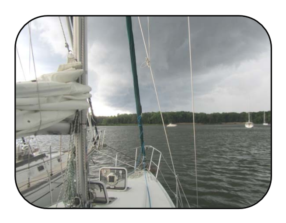
Incoming storm