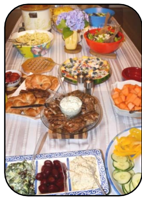
Lots of food brought to party instead of the boat