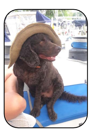
Bosum By Ed Menegaux