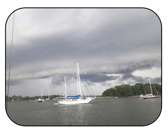
Approaching Storm